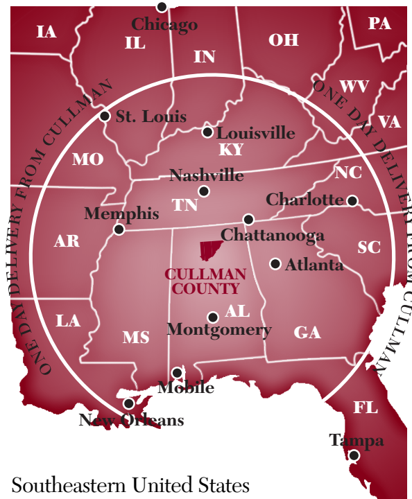
Southeastern United States